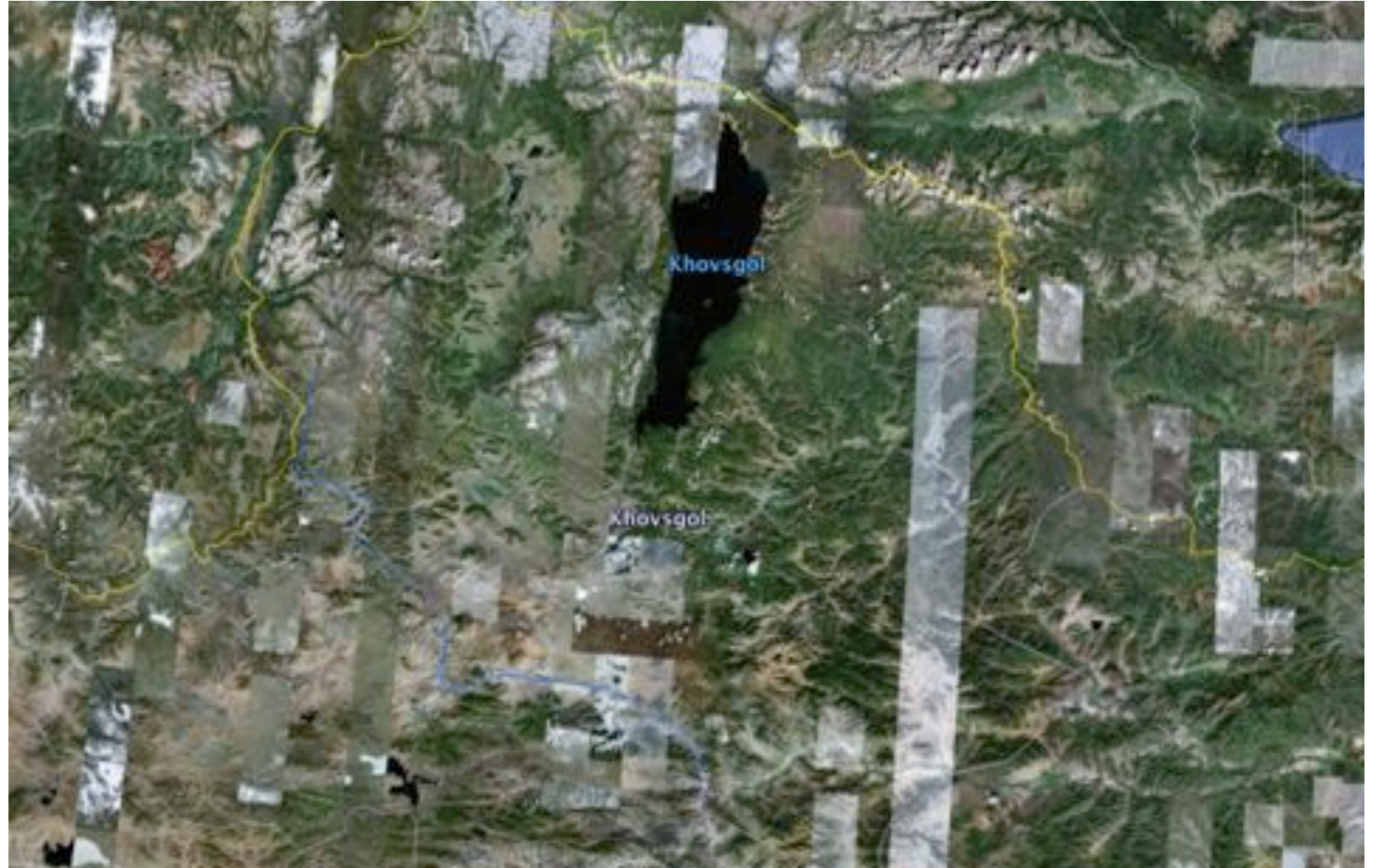
LOCATION, DELGER MURON, MONGOLIA