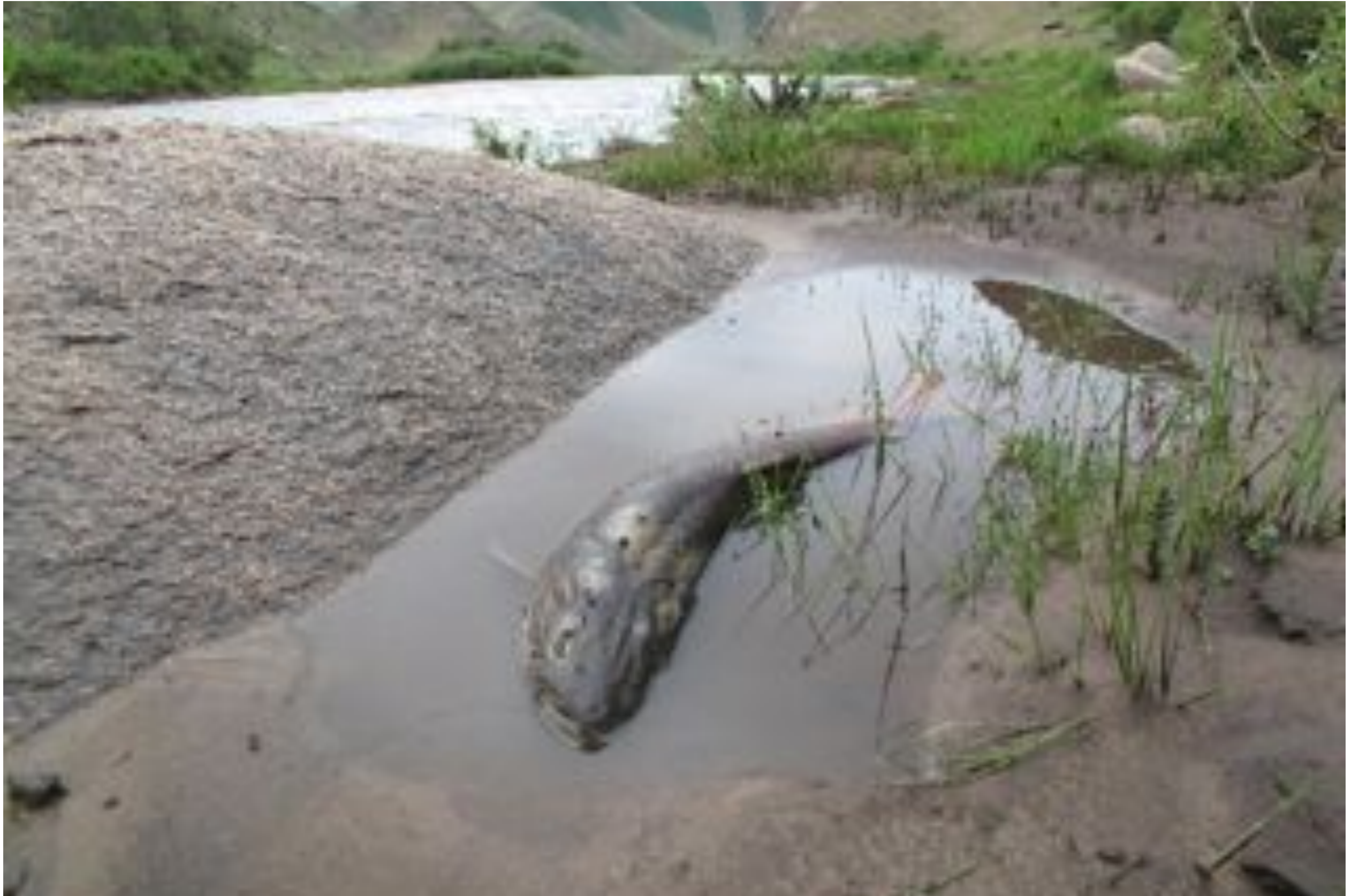
THREATS Habitat Degradation, Overgrazing, Climate Change