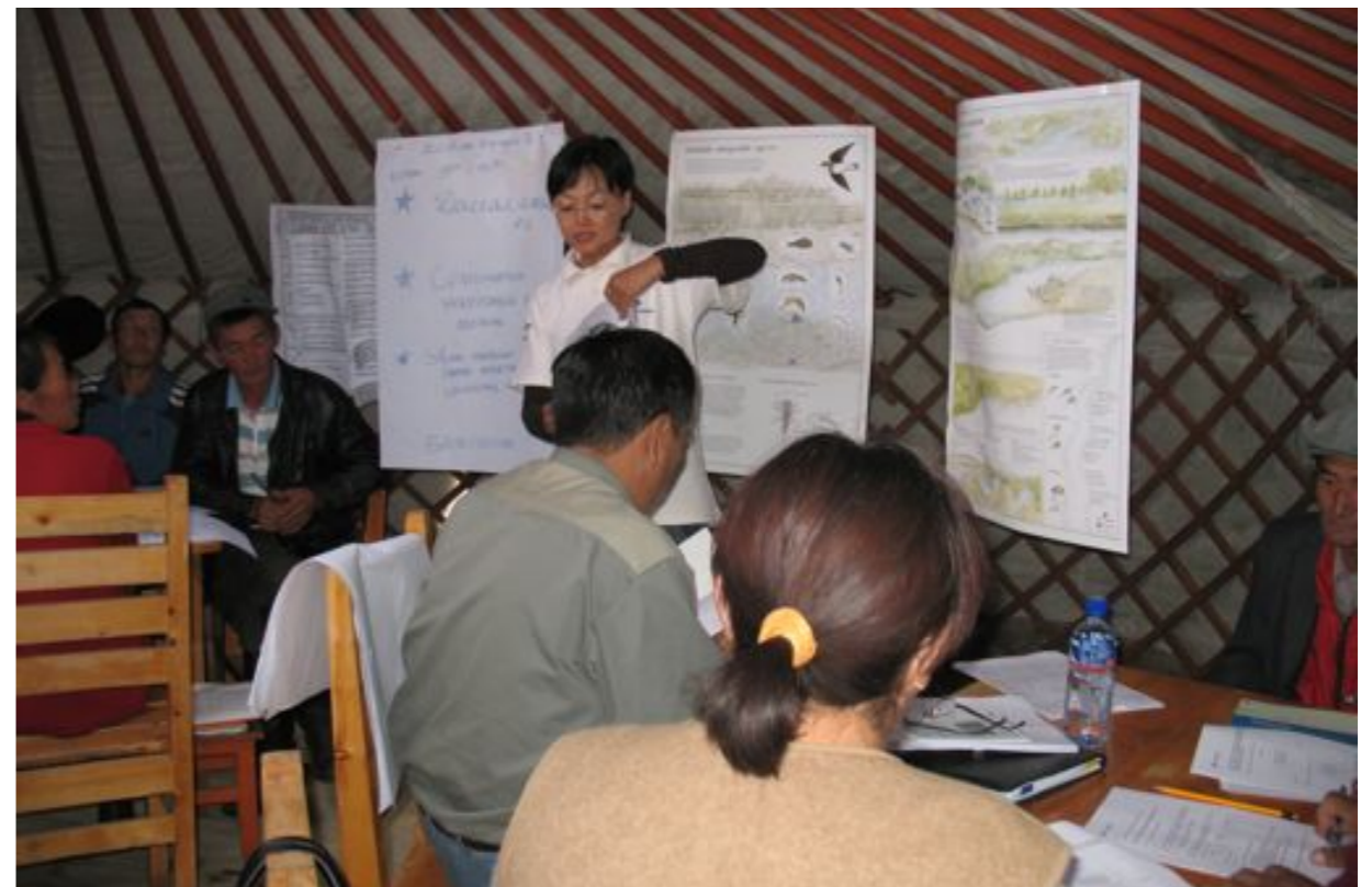
WATER QUALITY MONITORING WORKSHOP