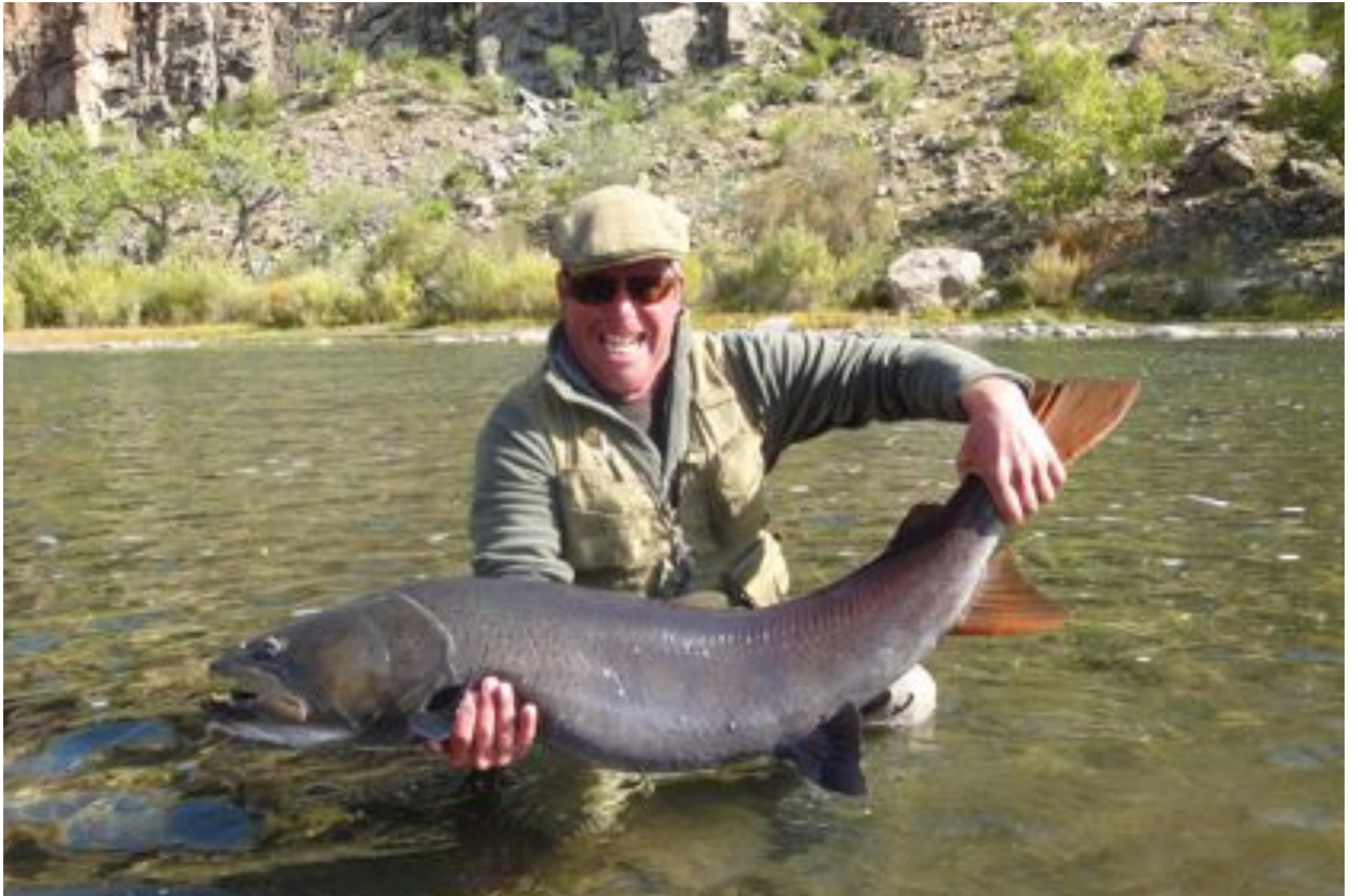
Taimen 150cm + Delger Muron September 2011 THANK YOU