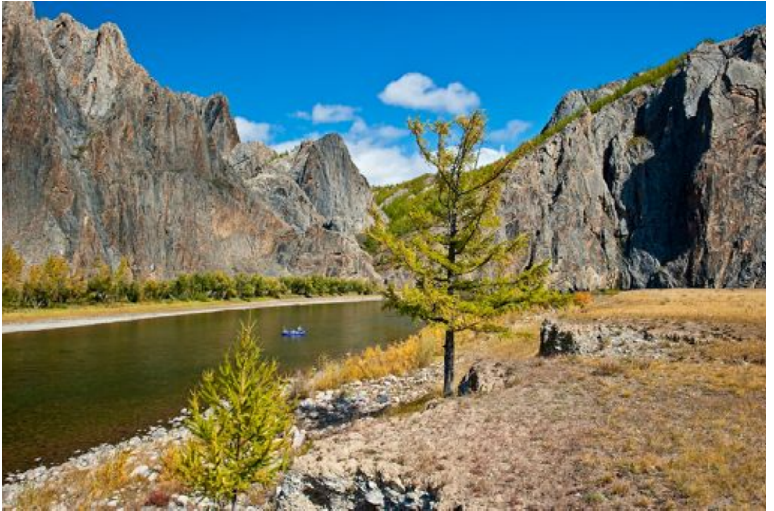
THE PRODUCT - FLY FISHING FLOAT TRIP