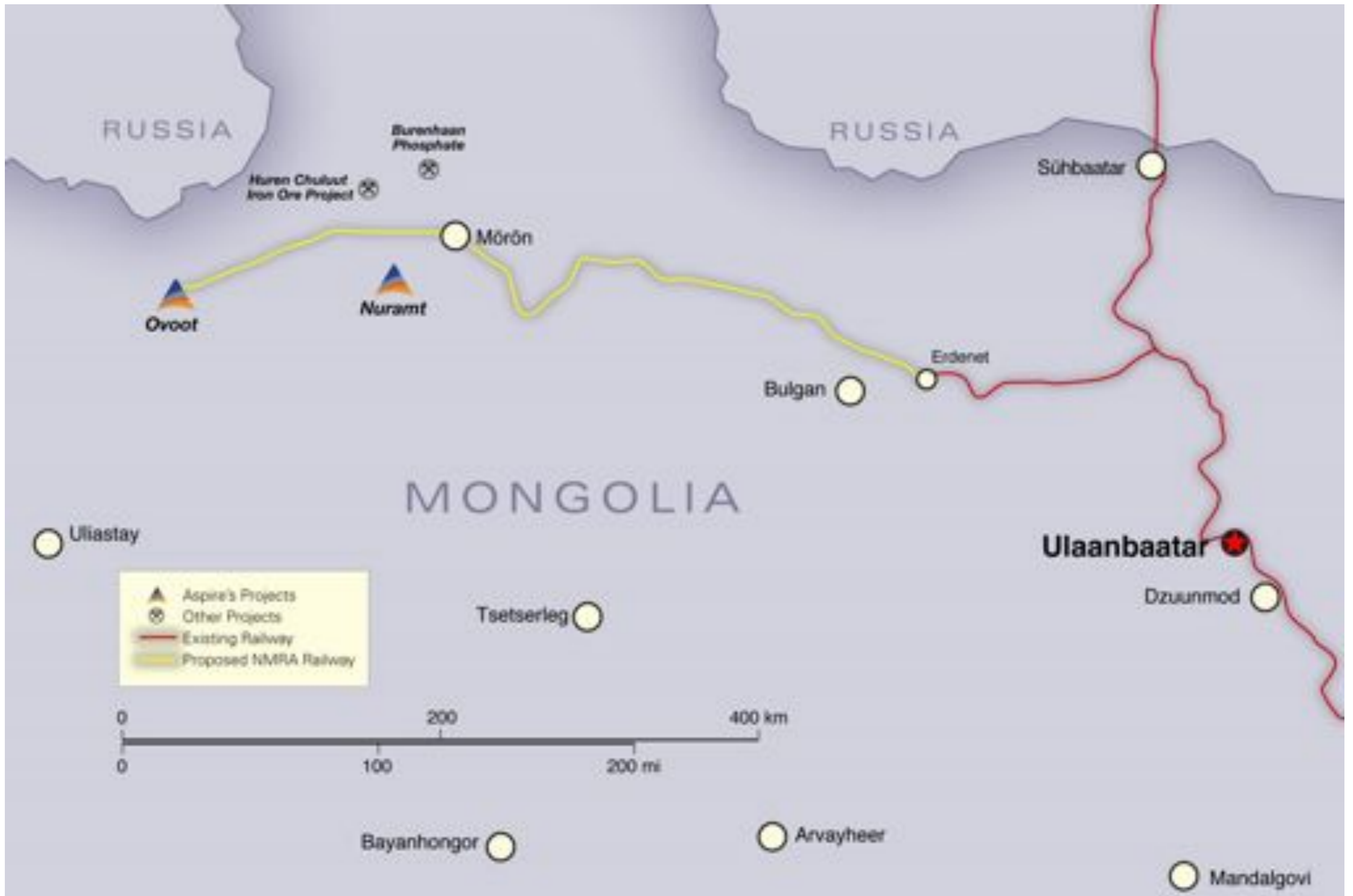
THREATS Licensed Mining and related Infrastructure. Northern Mongolia Rail Alliance