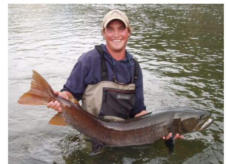
Angler Education Campaign - Spirit of the River