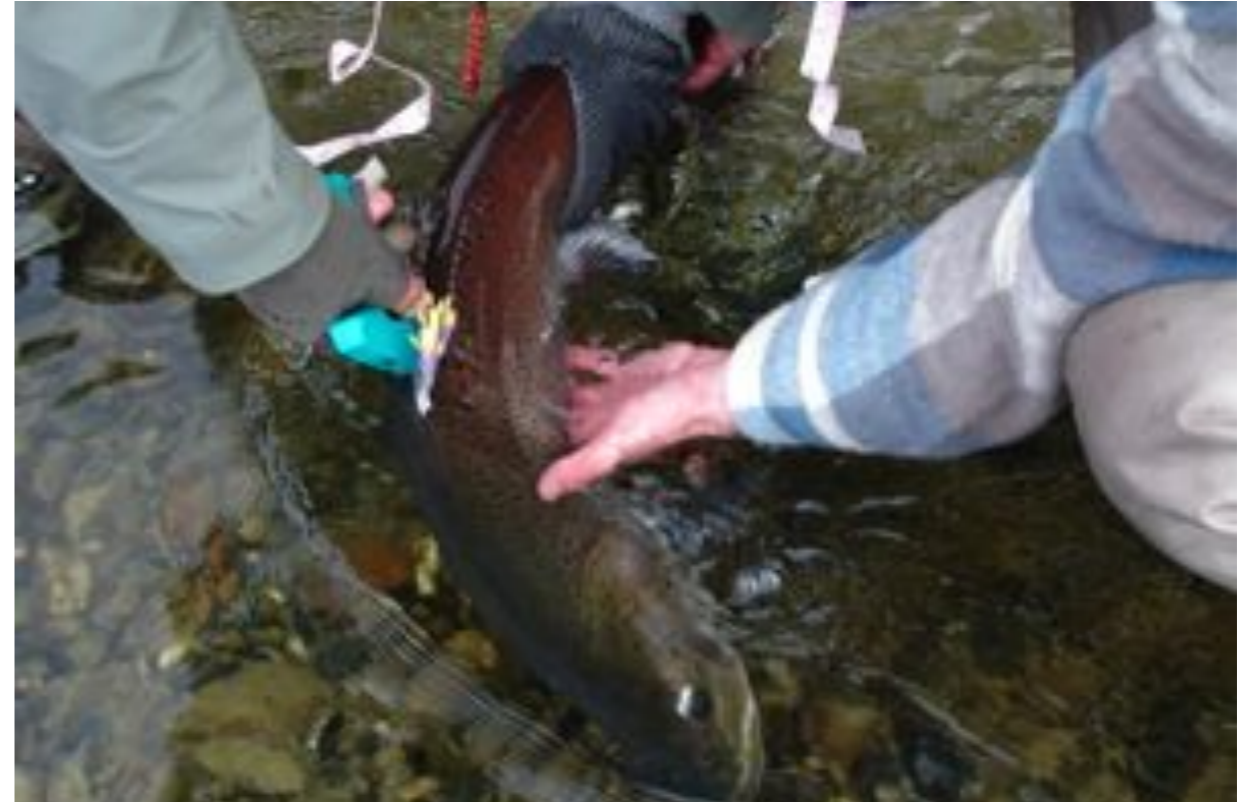
Taimen Size Distribution